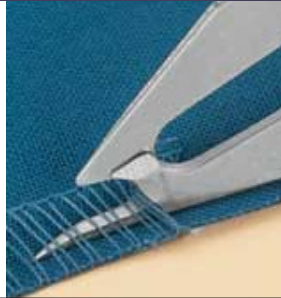
Ref : TC-SRC

Weverschaar metaal met tormmes en gebogen punt. Coupe-fil métal avec découvit et pointe courbée.