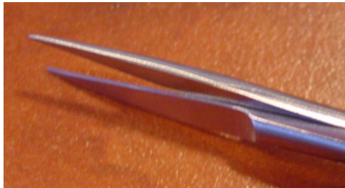
Ref : 4180

Borduurschaar Ciseaux broderie Embroidery nipper