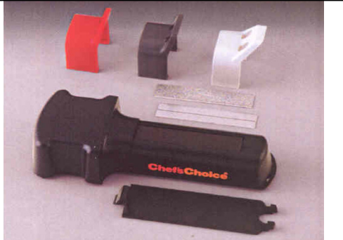
Ref. : 490 - Scharenslijpmachine 074.700.003

Kompakt, handig, klein. Schaar moet niet uit elkaar gehaald worden. Zowel voor rechts- als linkshandigen. Compact, maniable, petit. Sans nécessité de démonter les ciseaux. Pour gaucher et droitier. Save time and money by eliminating the need to replace your scissors or send them out for sharpening! This versatile, manual scissors sharpener will put a razor sharp edge on your household, kitchen, sewing, general purpose scissors and game shears quickly and easily...left or right handed! And you won't have to disassemble your scissors! The two stage sharpening system features interchangeable sharpening pads made of 100% diamond abrasives and precision angle guides for both conventional and knife-edge scissors. The fine diamond pad has a centre groove for sharpening pointed tools such as ice picks and awls. Compact for convenient storage.