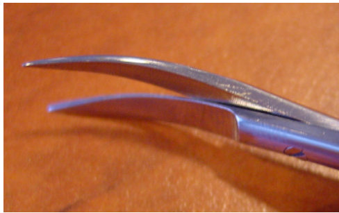
Ref : 4120

Borduurschaar Ciseaux broderie Embroidery nipper Gebogen - Courbé - Curved